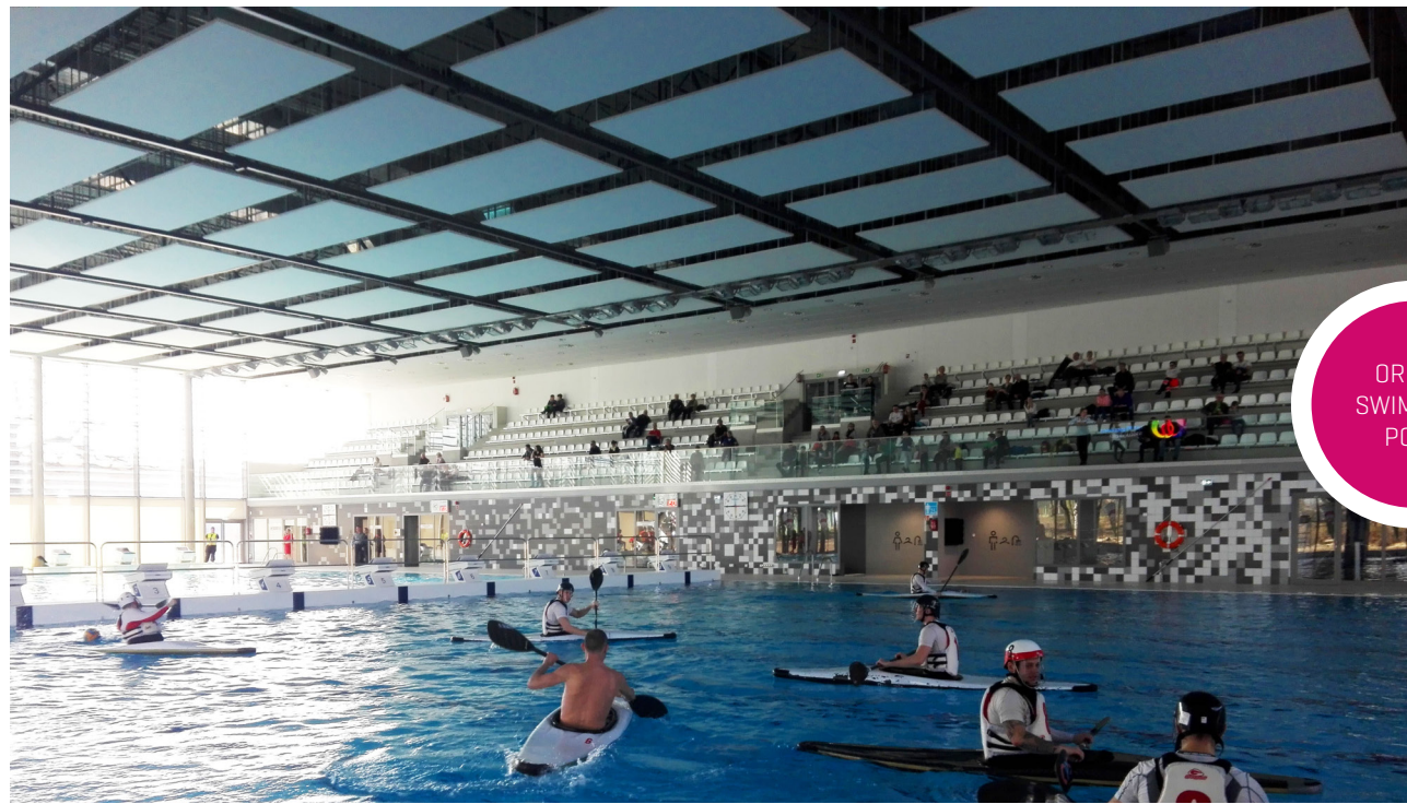
ORBITA SWIMMING POOL